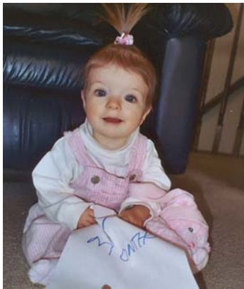
5-6-7 months Assumes Sit and Plays