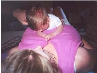
One week Start Tummy time