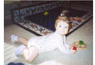
5-6-7- months Belly Crawl