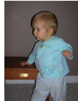
10-11-12 months Cruise/Stand/Walk