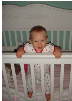
6-7-8 months Pulls to Stand