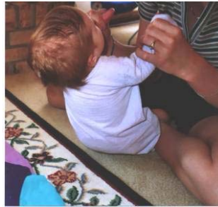
2.5 months Start Chin Tuck