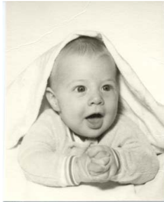
2 months Good Head Control